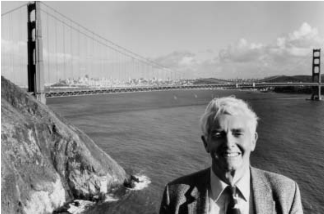
David Ross Brower (1912 - 2000)