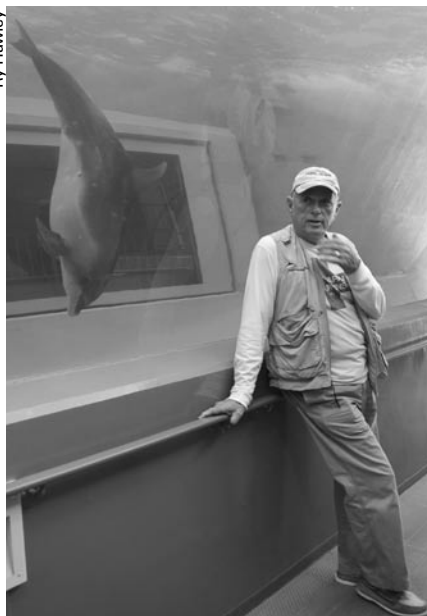
O'Barry at the Taiji Whale Museum

Like many people who are accustomed to being the center of attention, O'Barry is a mix of the withdrawn and the eager. He has the instincts of an introvert; "I've never been accused of making chit-chat," he wrote in his memoir. At the same time, he is an affirmation-seeker; "I've always liked people and wanted them to like me," he also wrote. It's a combination ripe for vulnerability. Which is why the performance is important: It allows him to stay committed to "the issues" without burning out.