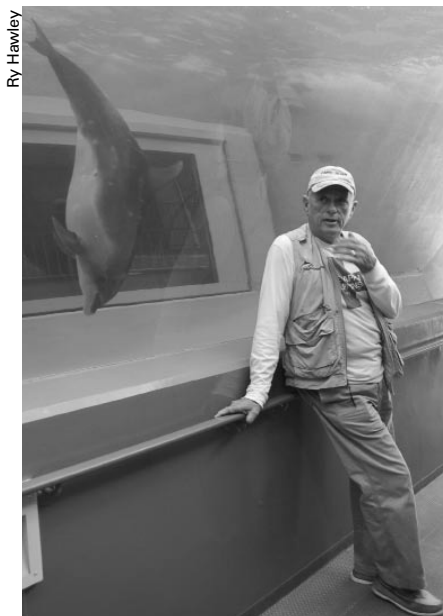
O'Barry at the Taiji Whale Museum

Which is not to say that he is insincere. Only that, like many public figures, O'Barry has crafted a persona, and this persona — with its parable-perfect story and snappy one-liners — gives him an armor that protects him from the world.